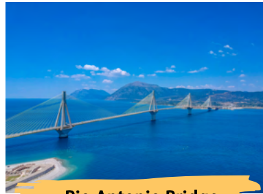
Rio Antonia Bridge

Connecting the Gulf of Corinth with the Saronic Gulf in the Aegean Sea. It crosses the narrow isthmus of Corinth, the Peloponnese and mainland Greece.